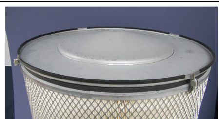
Shown With top end cap secured

The loose top end cap is packaged and shipped with its permanent gasket facing upward. It gets flipped over so the gasket seats against the top of the filter.