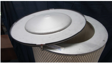
Shown Partially Assembled Open end is shown