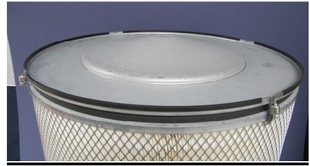
Shown With top end cap secured